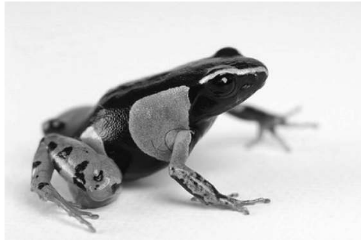
Magnification \times 2

3 Amphibians produce skin secretions that have antibiotic properties. In one study, scientists found antibiotic properties in secretions taken from different species of poisonous Mantella frogs. The photograph below shows an example of a Mantella frog.